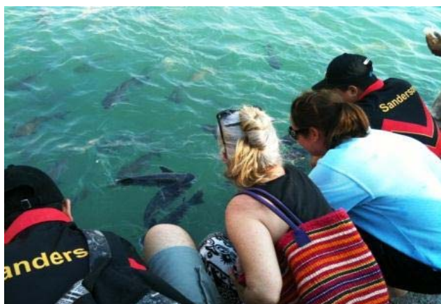
Students at Aquascene

The final day was centred around group activities, followed by a lunch organised by the students. The younger students presented a song. A very popular activity was viewing a slide show of the activities they had managed to squeeze into a very busy three weeks.