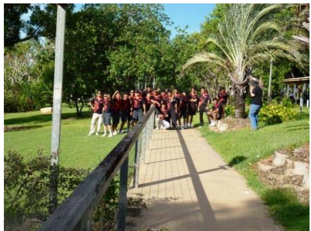
Students at the Darwin Botanic Gardens

In week two, the students visited Lake Leanyer Recreation Park, where they could swim, using the three slides (if they were over 1.2m tall), play in the water playground, or on the traditional playground equipment. They also had opportunities to play badminton and enjoy a traditional Aussie sausage sizzle. Ten-pin bowling was very popular and younger students also loved the opportunity to play in the adventure playground at the Nightcliff Tenpin Bowling Centre.