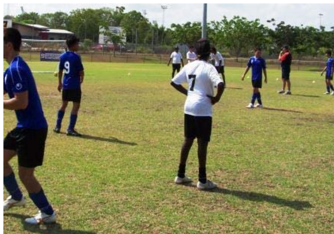
Students playing soccer

The following day the students went fish feeding at Aquascene, near the centre of Darwin. Students and staff enjoyed being close to wild fish and hand feeding them. The groups participated in other activities including team skipping, basketball, volleyball, badminton, table tennis, running races, sing-alongs, drawing, braiding and team problem solving and co-operation challenges. The older students also asked for and were given, some formal English lessons.