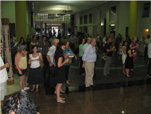
Part of the crowd at the exhibition

On December 8, a sizeable crowd attended the opening of the “Rights on Show” art exhibition in the Supreme Court Foyer. Contributions from local artists sat side-by-side with entries from asylum seekers.